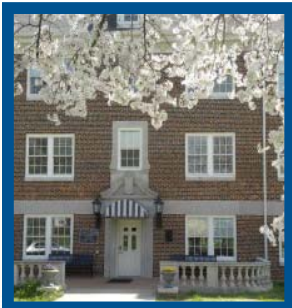
Sanders Hall, College of Business