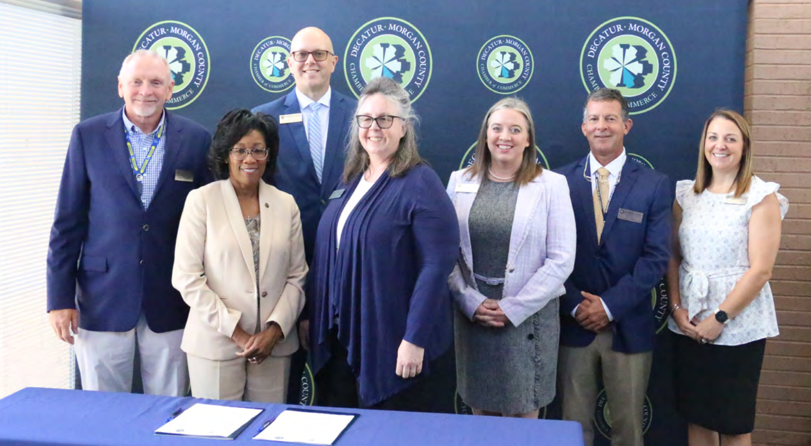
Photos from the Madison County and Decatur-Morgan County signings, respectively.