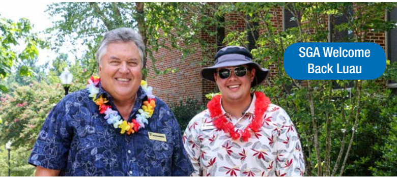
SGA Welcome Back Luau