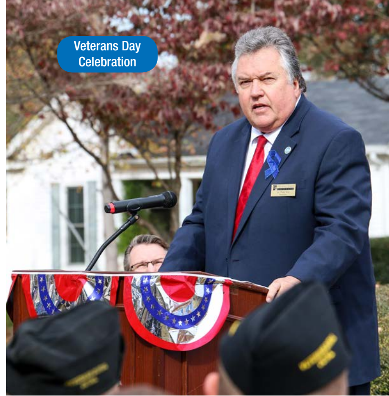
Veterans Day Celebration