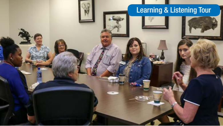
Learning & Listening Tour