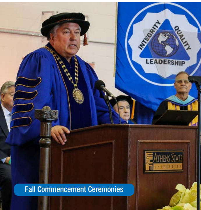
Fall Commencement Ceremonies