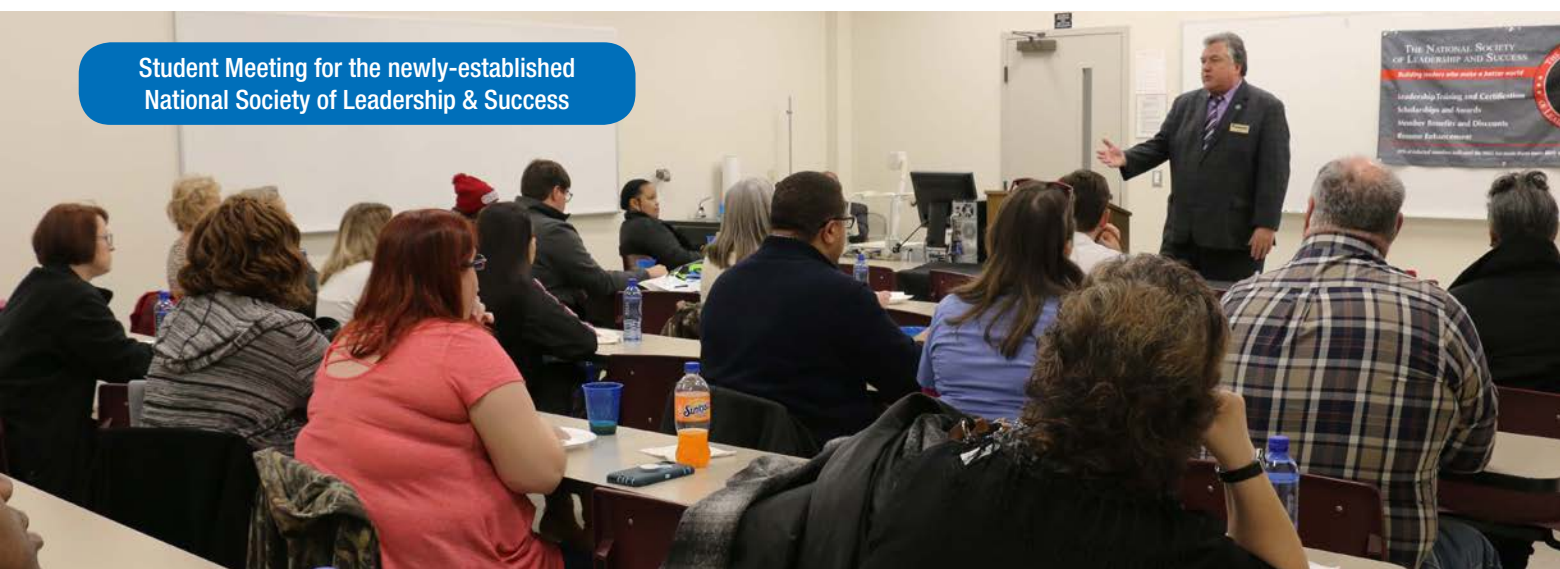
Student Meeting for the newly-established National Society of Leadership & Success